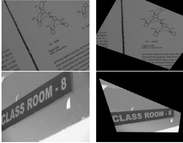
Figure 1: Circles in the left images were used to rectify them to get the right images. The circles representing the nodes of the graph in the book and the 'O's in the classroom board were used for rectification by projectively transforming them to result in circles. The rectification is quite good; the images on the right show the quadrilaterals to which the rectangular images on the left map.

Figure 1 shows the single view of some of the images containing unknown coplanar circles and their rectified images using the above algorithm. In all our experiments, the equations of the conics in the image were computed from their boundary points by the method described in [6]. The method has the advantage of explicitly modelling noise and providing a reliability score.