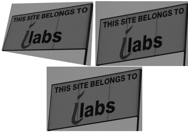
Figure 2: The homography between the top images was computed. The bottom image is the result of applying it to the top left one.

they are images of circles. The previous approaches to 3D reconstruction from conics [8, 11] are restricted to the case of multiple views. Our approach is similar to the one in [2], which finds 3D affine measurements from minimal geometric information such as the vanishing line l of a reference plane and a vanishing line for another plane not parallel to the previous plane v . To calculate the height of an object, we use a reference height Z_r specified by a base point b_r and a top point t_r , a parameter \alpha such that