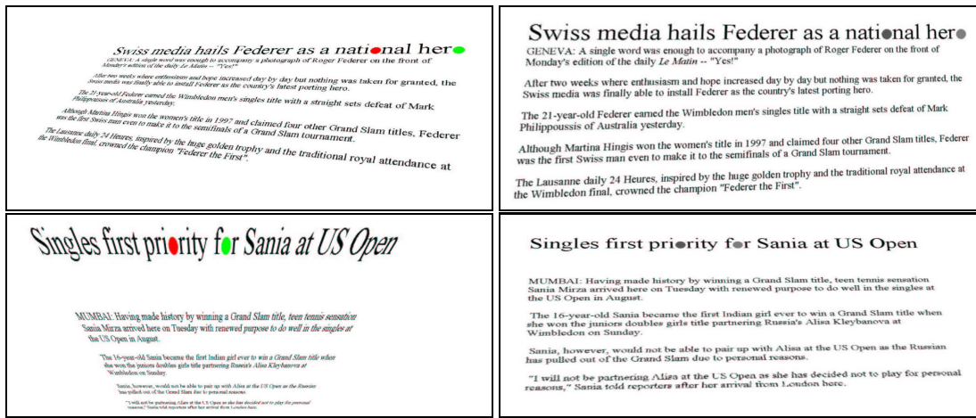
Figure 4: Right images give the rectified versions of the left ones.